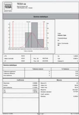
Detailed report for each measured part features